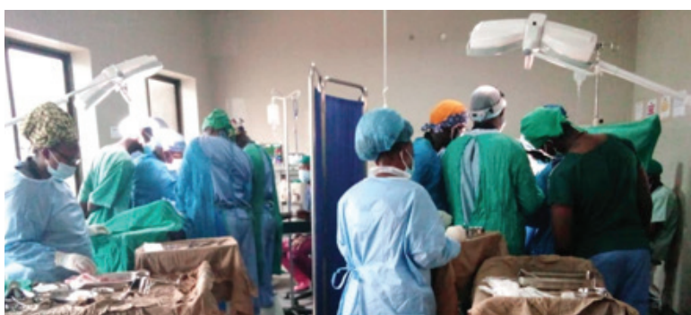
Parallel surgical cases going on